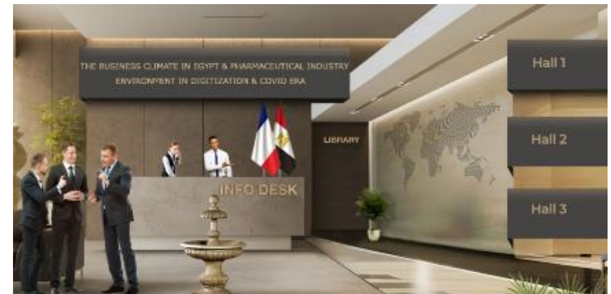
This is developed by Qsysi